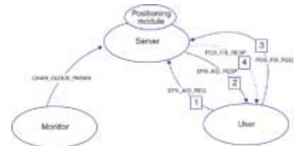
Figure 2: Message flow in the TV-based positioning system

Figure 2 shows messaging flow in our system. The user devices (TV measurement modules) generate a "Dynamic Aid Request," which is satisfied by the "Server Dynamic Aid Response." The Dynamic Aid Response message contains regional monitor unit measurements for that particular geographical area. The user device replies with a "Position Fix Request" message. The "Position Fix Response" message contains timing measurements that allow the positioning algorithm in the user device to assemble pseudoranges much like a GPS receiver does.